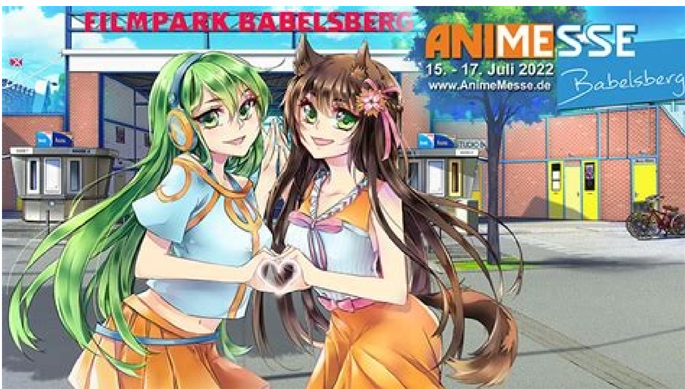
Anime conventions in germany.